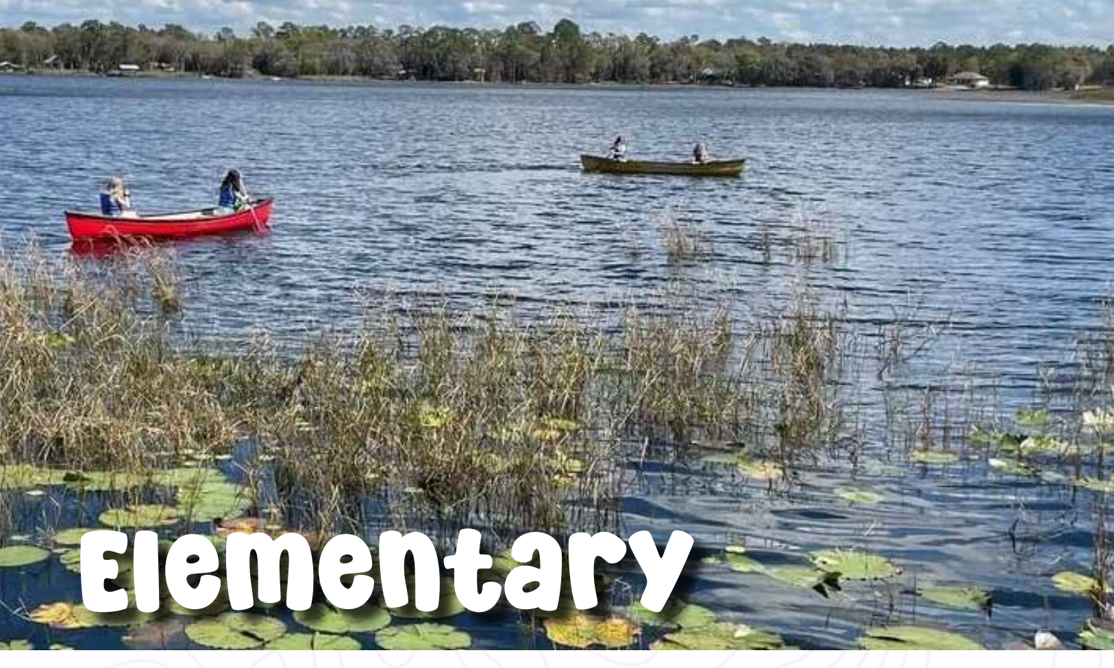
For youth who have completed grades 1-5